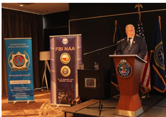
Lech Wałęsa speaking to FBI NAA alumni